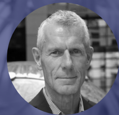
Helmut Sholz Member of the European Parliament, Committee on International Trade Member of the European Parliament's Steering Committee for the Parliamentary Assembly at the WTO